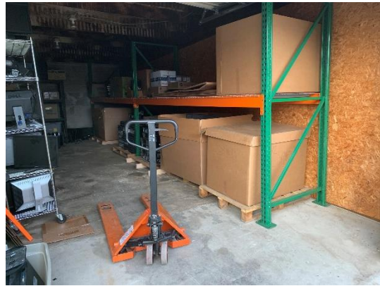
New pallet racking in storage shed.