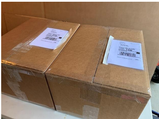
Boxes with laptops for Africa