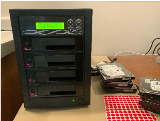
Acumen device used to sanitize and duplicate computer drives